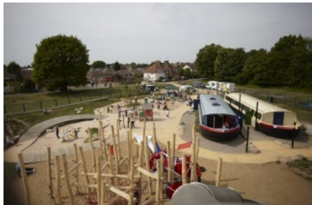
Wisbech Adventure Playground. Courtesy: Sutcliffe Play (main contractor and designer) and Snug & Outdoor (additional play and design)